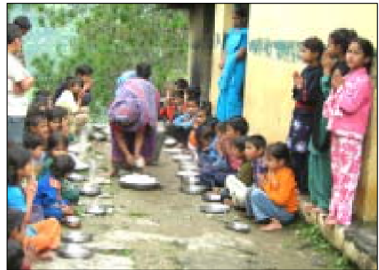
Distributing food to communities in need.

This Lisle-MCF Community Engagement project consisted of a series of ten workshops with 330 young people in rural mountain communities in the Indian state of Uttarakhand, India. The purpose of the workshops was to help young people see themselves as agents for change in their villages, identify issues they want to address, and develop strategies for how their children's group can begin solving those problems. It also provided an important opportunity for the MCF to reach out to new partners with a concrete, inspiring activity to help build energy around their nascent children's groups