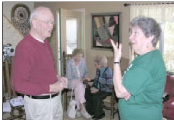
Darwin and Betsy engage in a lively discussion.

The Board discussed concerns about partially-funded projects and concluded that: when allowing for