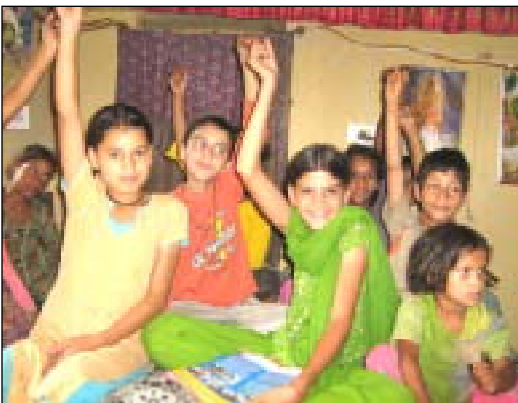
Children participate in workshops to learn to become agents of change.

The Lisle Seed Grant funds helped us lay the groundwork for youth community involvement. The workshops funded by this grant have helped change the way young people in rural mountain villages see themselves and their role in making life better for everyone in their community. Through this project, the children who participated have begun to see how they can make a real, tangible difference in their own lives. They are experiencing the first thrill of empowerment and others in their villages are taking note.