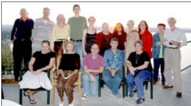
The whole crew on the deck at the Oasis restaurant overlooking Lake Austin, at sunset. The fellowship was warm and the colors were extravagant!

Friday, Saturday and Sunday morning we had general meetings with additional time to split off into committee meetings and small discussions groups. We took time for socializing and discovering Austin.