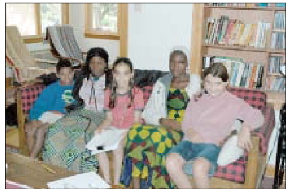
An "expanded" family in a host home.