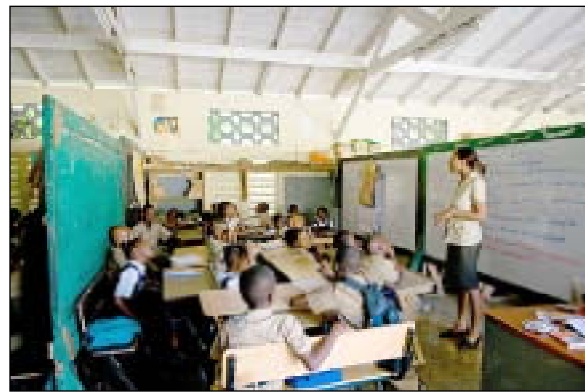
Classroom at Sheffield All Ages School