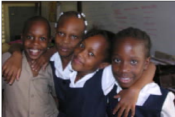
Students in their school uniforms loved our attention!

Day 3, November 21: Good morning! The roosters woke us, rather than yesterday's "reggae radio." The sea has calmed down a lot with waves still breaking on the cliffs, but no spray splashing over the seawall. Yesterday we went to the school and found that they were having an "expo" for the parents with information on health, dental habits, STD's, maternal health, etc. Needless to say, the children were not in a concentrated mood, but it was good to know that the school serves public purposes.