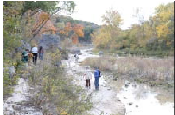
A lovely afternoon’s exploration up a creekbed. The fall colors were stunning and many fossils were seen.