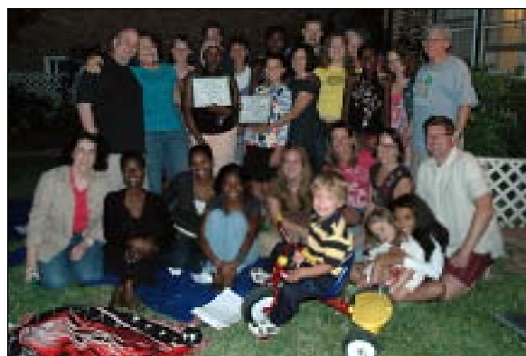
Families who are “expanding their lives.”

“MICA” (MicroCredit for Africa) helps to identify young women who are successful in school, socially responsible, and the first generation in their families to attend secondary school. For six weeks between school sessions, the young women (aged 16-21) stay with host families in the US and attend educational courses aimed at improving their lives and the lives of community members in Niger. Last year’s participants were especially receptive to courses in community health, AIDS