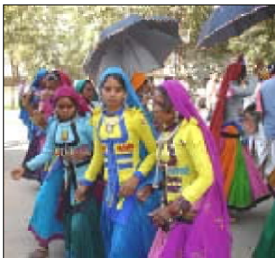
Tribal woman in the Gujarat.