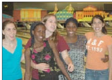
Girls out for a night of bowling.

become community leaders. However, few international programs exist for young people from the world’s poorest countries, and those that do usually promote travel by American and European youth to developing countries. To bridge this gap, Expanding Lives partners with “MICA”, a women’s empowerment organization in Niger, West Africa, to provide educational travel opportunities for young women who can influence their country’s progress in areas of health, literacy, and human rights.