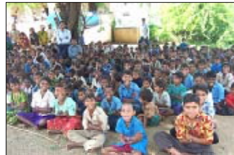
Tribal children await the program..

* One-day camps for both 100 children and for 100 selected teachers belonging to all religions from both sections of society.