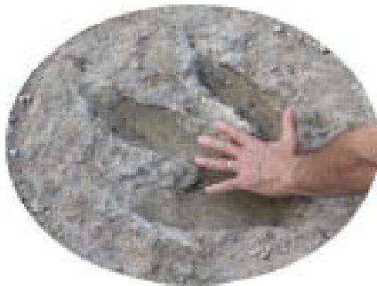
Fossilized dinosaur print in the creekbed near Leander, Texas. Whose human hand is that?