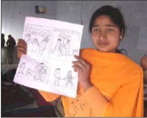
An MCF participant shows her instructive hand-drawn cartoon.