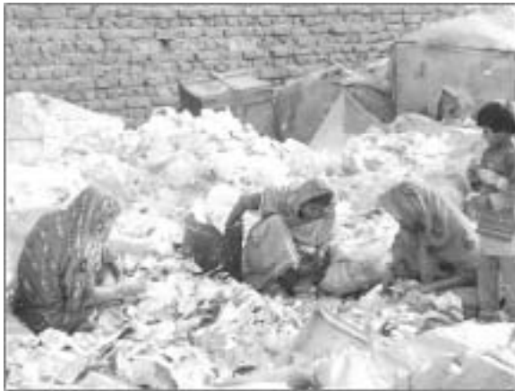
Women sorting through waste to help support their families This is unsafe and difficult work.

concerns about physical and verbal harassment and the tremendous amount of exploitation women face in their work and domestic environments. For this, the women clicked photographs (using our Chintan Camera) and made a presentation to the community, which portrayed women's day-to-day routine, including personal moments between mothers and children, chaotic and unending tasks, unhygienic living and working conditions, and also their enthusiasm and strength for life.